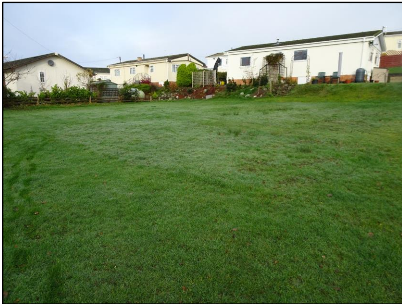
The hay meadow at Sunny Haven Caravan Park. Photographed in December 2022, a few weeks after the removal of rank vegetation.