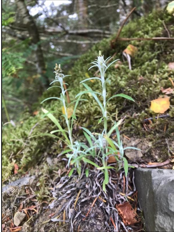
Heath Cudweed flowering for a second year running at the Gwarallt Wood introduction site. Photographed late summer 2022.