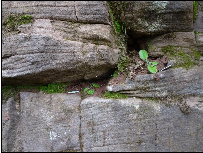
Two introduced Beacons Hawkweed plants at Fan Nedd. Carefully planted into a fissure of rock. Photographed in September 2021 immediately after planting.