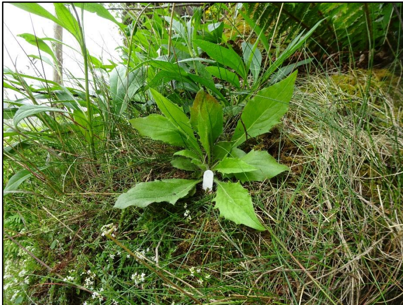
An introduced Beacons Hawkweed plant. Flourishing over twelve months after introduction to Fan Nedd. Photographed in July 2022.