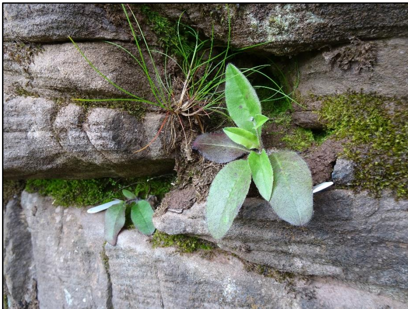
The same two plants the following summer. The plant on the right is in bud. Photographed in July 2022.