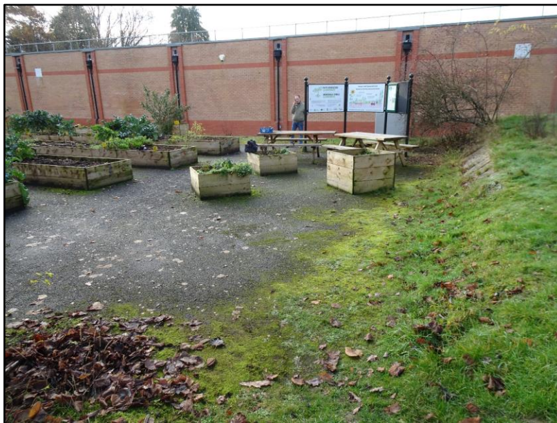
Arlais Community Garden. Marginal areas where the tarmac is being colonised by mosses and small annual plants were seeded with Deptford Pink and Annual Knawel.