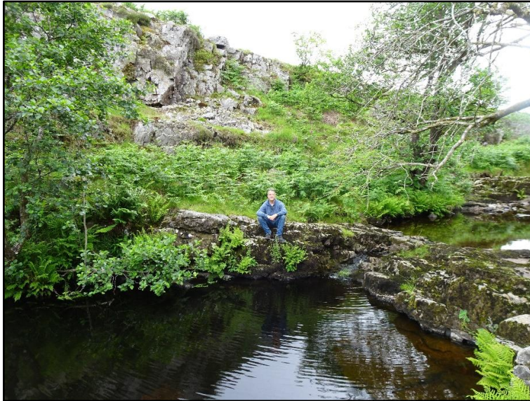
Sitting on a rock ledge in the Hepste Glen, next to the last remaining wild Hepste Hawkweed plants.