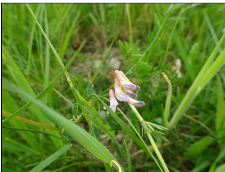
Wood Bitter-vetch flowering over one year after being introduced to Gilfach's hay meadow.