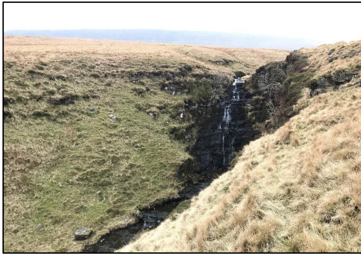
Black Mountain Hawkweed currently only grows on rocky ledges next to a waterfall in the Upper Tawe Valley.