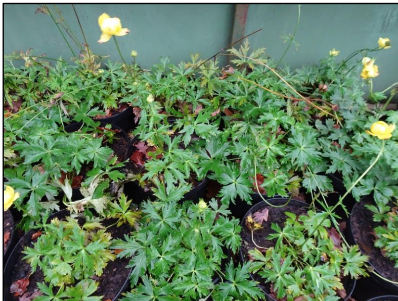
Gilfach Globeflowers in cultivation at The Rare British Plants Nursery. Photographed in December 2022. It's winter but many of our cultivated Globeflowers are in full flower!