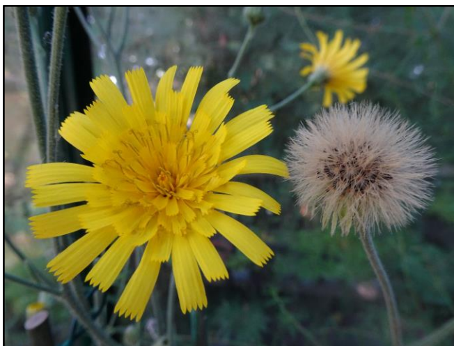
Crass-leaved Hawkweed in cultivation at The Rare British Plants Nursery.