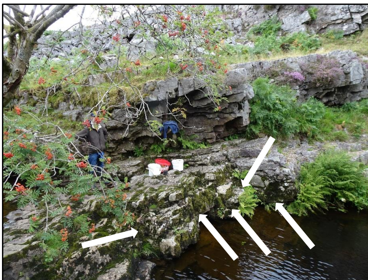
Hepste Hawkweed introduction site located on riverside rocks opposite the existing wild population. Arrows show the location of some of the introduced plants. All these plants were still present over one year after being introduced and had survived a number of floods & droughts.