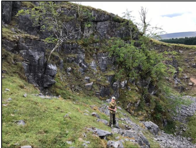
Pwll Byffre, the last remaining site for Crass-leaved Hawkweed. Its future here is uncertain, overgrazing by sheep has reduced the population to just ten plants.