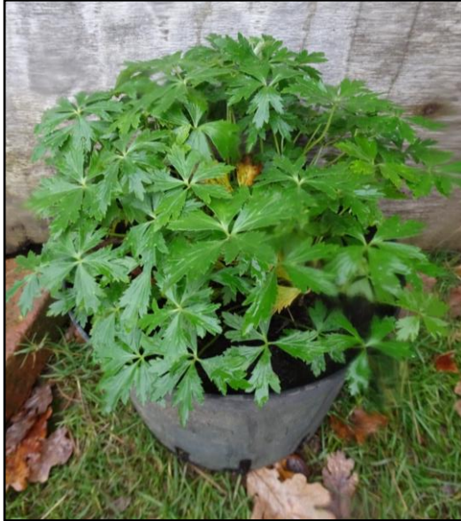
Llanbwchllyn Lake Globeflower in cultivation at The Rare British Plants Nursery.