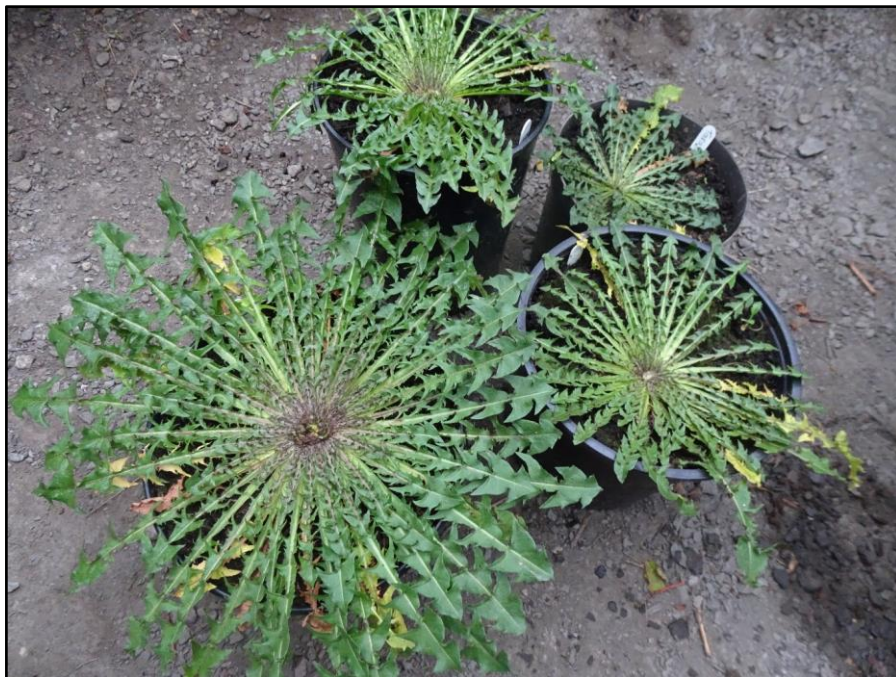
Brecon Dandelions grown from seeds supplied by the Millennium Seed Bank. Photographed December 2022.