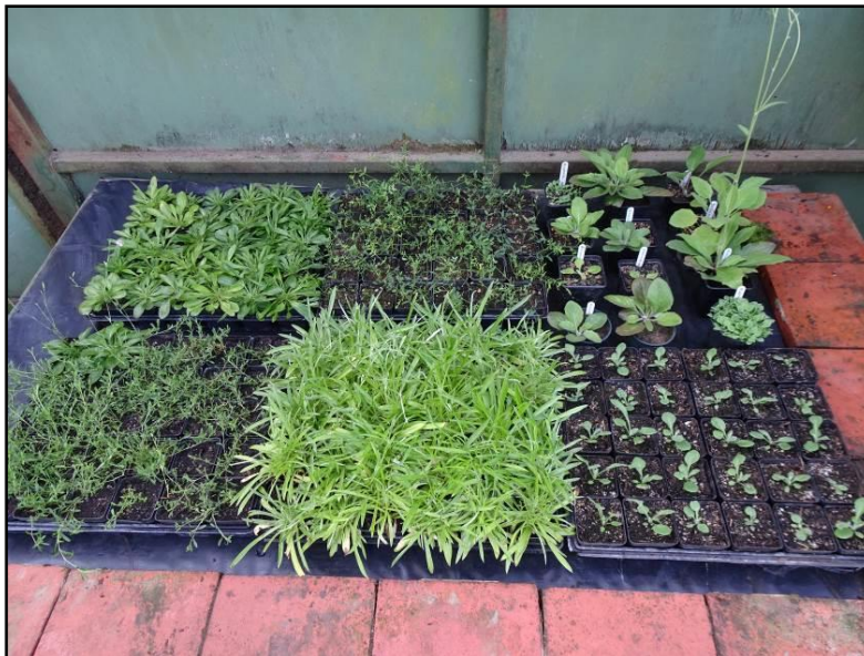
Rare plants in cultivation at the Rare British Plants Nursery.

Back left to right: Spreading Bellflower, Wood Bitter-vetch, Beacons Hawweed.