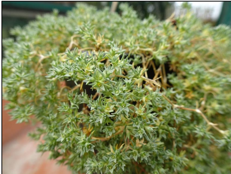
Annual Knawel in cultivation at the Rare British Plants Nursery.