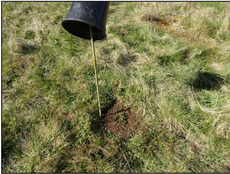
Wood Bitter-vetch immediately after planting.