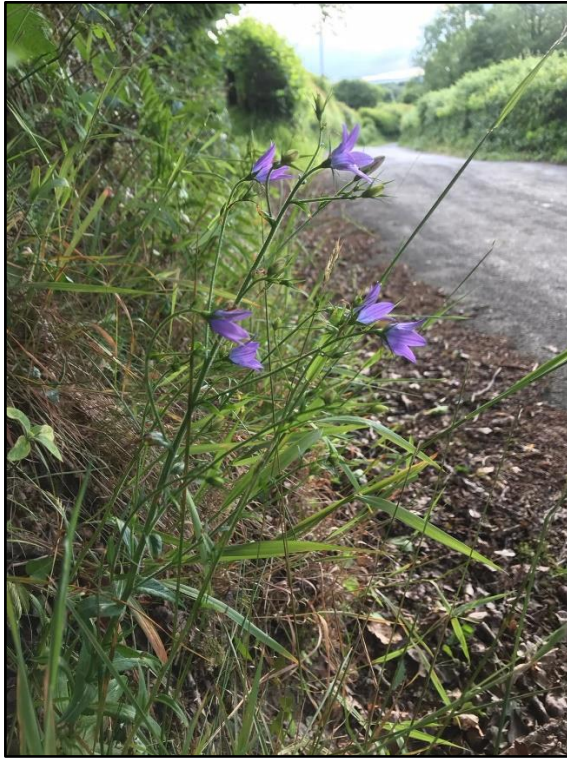
A flowering Spreading Bellflower. Photographed late summer 2022, over one year after being introduced to Gwarallt Wood.