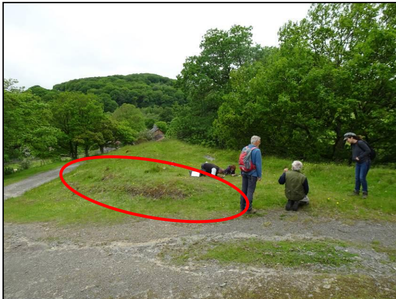
One of the Maiden Pink introduction sites at Penrhiw.